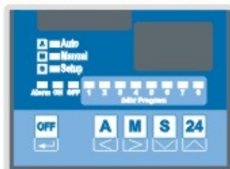
Digital control panel with 24hr program.