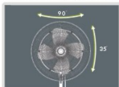
3-speed, variable pitch oscillating fan.