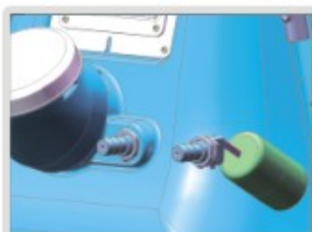
Hose connector inlet with float valve shutoff.